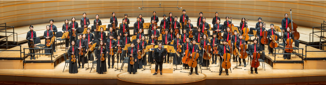
Pacific Symphony Santiago Strings | Sonic Narratives, Nov. 19