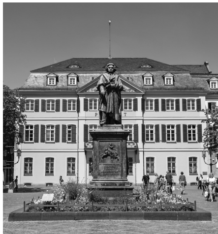
Ludwig van Beethoven monument and post office in the centre of the city of Bonn, Germany.

In the sublime third movement, the piano keeps returning to the dramatic main theme despite the allure of one sub-theme after another. The structure is a traditional rondo form – A-B-A-C-A-D-A. It builds with a sense of joyful drama. Hearing it, we can put a different twist on Liszt's description: Apollo, in his chariot of light, triumphantly bringing music to the world.