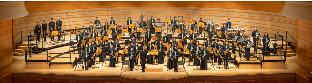
Pacific Symphony Youth Concert Band | Seeing Sound, Hearing Colors, Nov. 19