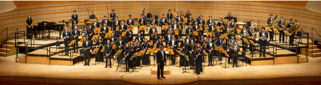
Pacific Symphony Youth Wind Ensemble | Reaching Forward, Looking Back, Nov. 21