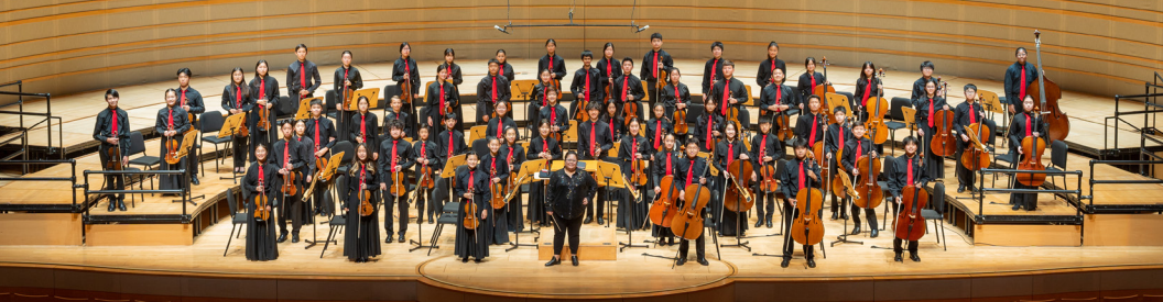
Pacific Symphony Santiago Strings | Sonic Narratives, Nov. 19