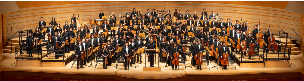
Pacific Symphony Youth Orchestra | Indivisible, Nov. 20